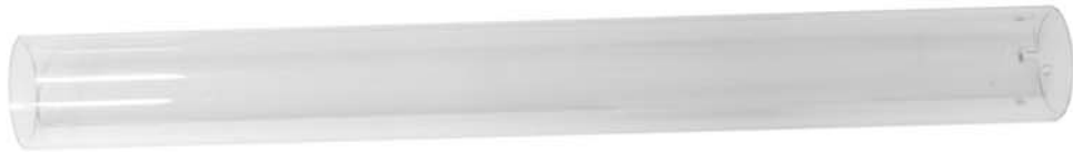
INNER CONFETTI BARREL