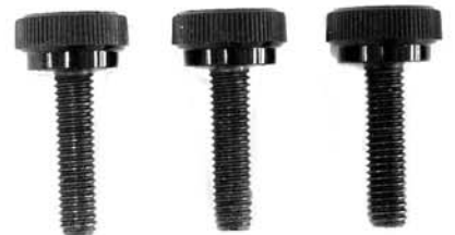
(3) - 10-32 1" thumb screw