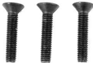
(3) - 10-32 1" flathead screw