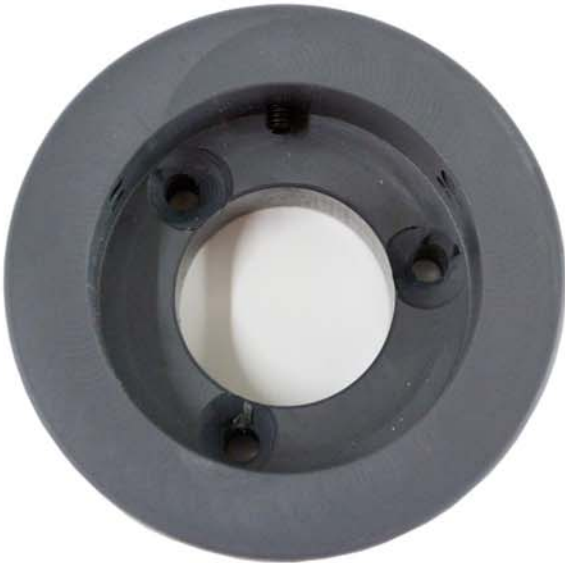
CONFETTI ADAPTER PLATE