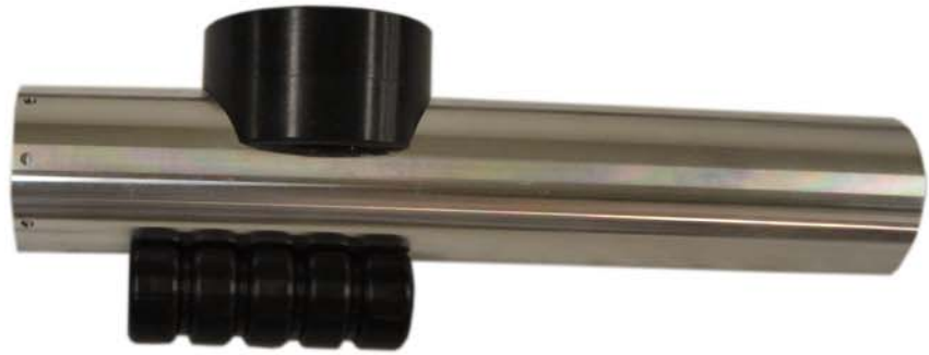
BALL LAUNCHER ADAPTER ASSEMBLY