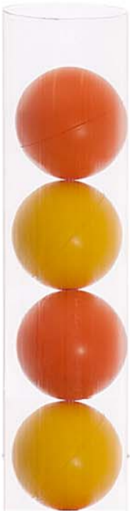
FEED TUBE (SHOWN WITH STRESS BALLS)